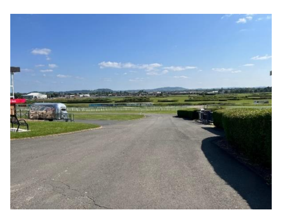
View to the track from parade ring

The enclosures then slope southwards towards the racetrack itself and in front of the grandstands towards the on-course bookmakers and finishing straight.